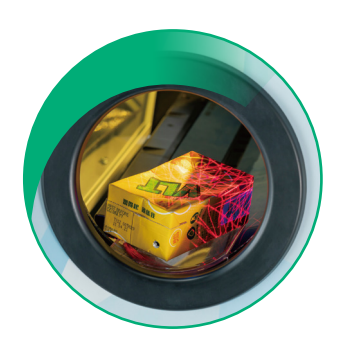
TETRA PAKS UP TO 375mL