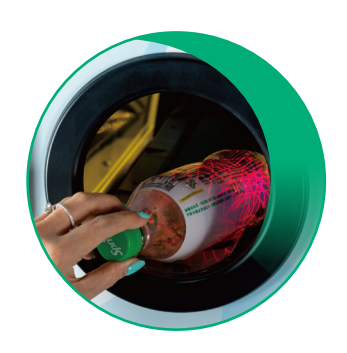
PLASTIC BOTTLES UP TO 1.5mL