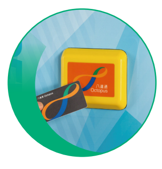
SIMPLY TAP YOUR OCTOPUS CARD