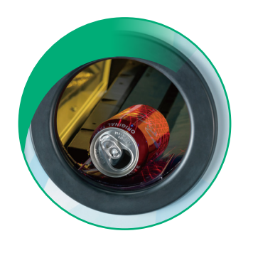
CANS UP TO 355mL

Make the world a better place with a new Corporate Social Responsibility initiative for your company. The RenatureChest breathes new life into recycling with its easy two type package recycling and consumer reward programs.