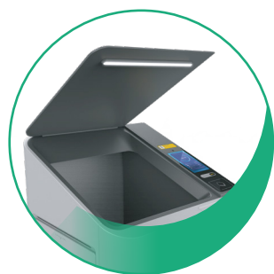
LED LIGHT FOR DARK ENVIRONMENTS